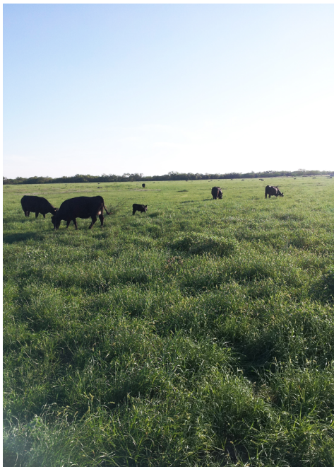
Figure 7. Cattle grazing buffelgrass.

When restoring the pasture, plants typically establish best when deferred from grazing or haying for some time. Allow-