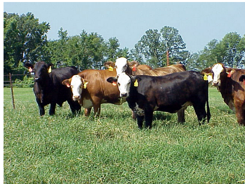
Figure 1. Cattle grazing Tifton 85 bermudagrass.

Objectives should be measurable and revisited at the end of every year or season. For example, you may want to increase calving rates by 5 percent or to harvest deer to meet a predetermined sex ratio. Before planting a pasture, determine if the land will be managed solely for livestock production or does wildlife contribute to your profit or recreational interests?