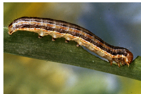
Figure 9. Fall armyworm.

Use only 25 percent of the total forage produced on a native pasture for livestock, accounting for insects, trampling, and stubble, which should be left standing. This stubble maintains healthy plant root systems, provides cover for wildlife, helps water infiltrate into the soil instead of running off, prevents soil erosion, and provides many other important ecosystem benefits. In our example, the native field yielded 3,000 pounds of forage per acre. Introduced grasses can safely be grazed more intensely than natives, so we estimate a 50-percent use of buffelgrass (of 4,500 total pounds per acre) and 65-percent use of Tifton 85 (of 5,000 total pounds per acre).