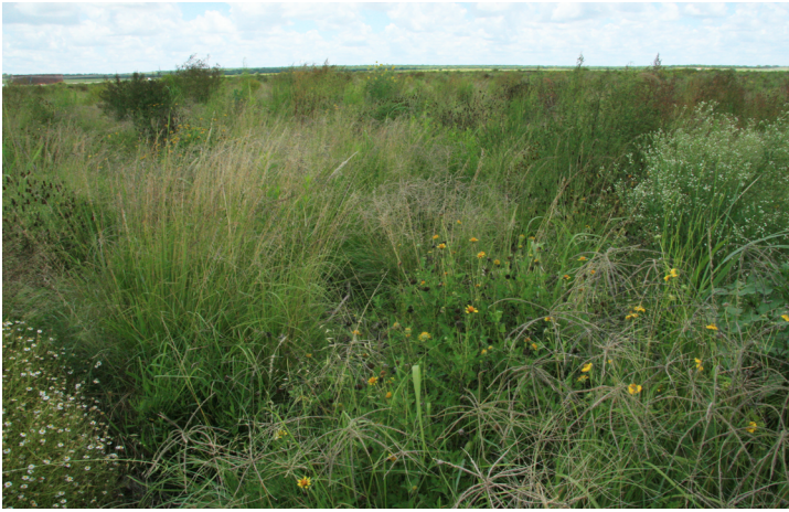
Figure 6. A diverse native plant pasture.