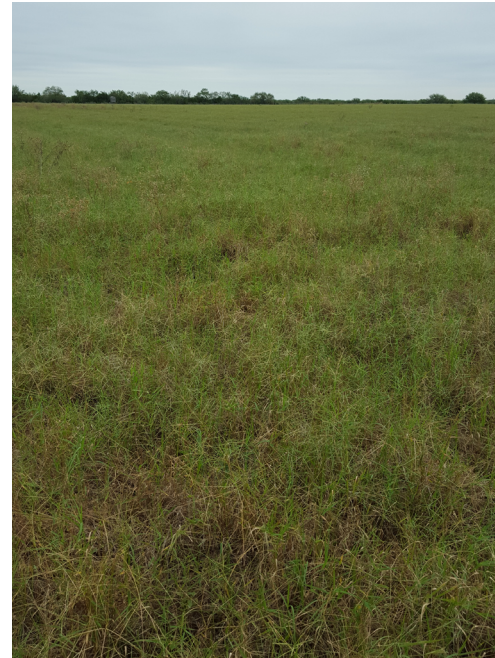
Figure 8. Bermudagrass field.

ing the plants to seed out fully adds valuable seed back into the soil for germination later. Native plants cannot withstand the grazing intensity that introduced species can, nor can they be grazed as soon after establishment as introduced forages. So, deferring grazing for 2 years is recommended for natives, whereas buffelgrass or Tifton 85 can be grazed or hayed a year after planting (Table 3).