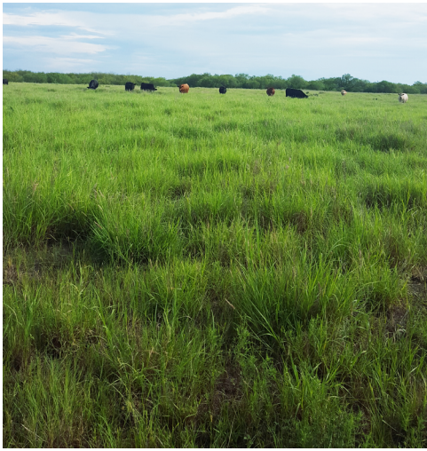
Figure 3. Buffelgrass is a common South Texas forage planted solely for cattle grazing.

establish, and have the potential to grow more forage per acre than most native plant species (Fig. 3). Planting these grasses could translate into grazing more livestock on the acreage with less delay after planting. However, these introduced species need more inputs, such as fertilizer, irrigation, or weed control to do well. Also, they typically grow as a monoculture, or pasture with one dominant grass species, which is far less desirable for wildlife management.