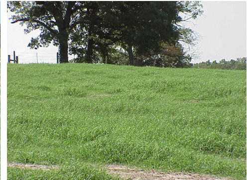
Figure 5. Stages of a bermudagrass planting from early June through late August.

any, input costs associated with fertilizer and herbicide.