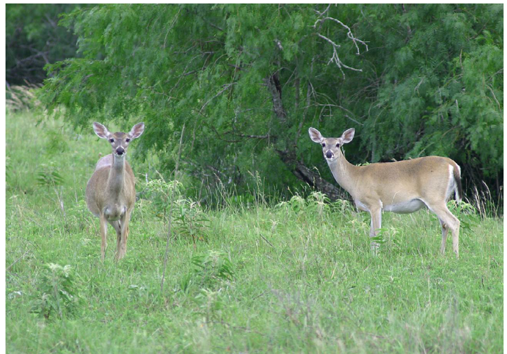
Figure 2. Wildlife species, such as white-tailed deer benefit from a diversity of plants in the pasture.