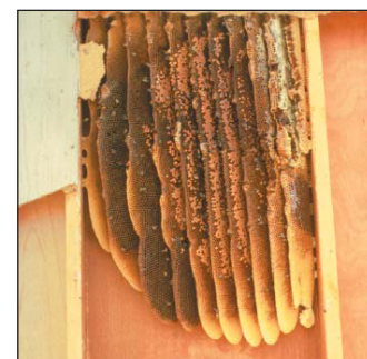
Bees can construct large wax nests rapidly once they enter a home. For this reason, both bees and nests should be removed as soon as possible.

easy to distinguish bees from wasps. Bees are generally hairy, with stout bodies and wide, flattened hind legs for carrying pollen ( see figure ). Wasps are generally smooth or have scattered hairs; they also have distinct “waists.” Another way to tell the two types of insects apart is to find the nest or hive. Honey bee colonies build a wax comb in which to rear their young and store food. Social wasps form nests of paper-like material.