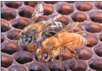
An Africanized honey bee (left) and a European honey bee on a honey comb. Despite color differences in these two individuals, the two strains cannot be distinguished visually.

Once away from the attack, remove the stingers as soon as possible. Stingers should be scraped out with a fingernail, knife or some other sharp object. Stingers continue to inject venom for many minutes after the initial sting. The sooner a stinger is removed, the less venom will be injected. If you