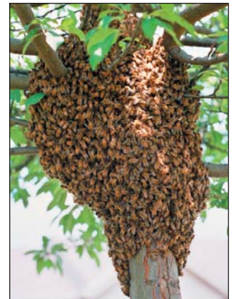
A honey bee swarm.

Because swarms do not have a nest to defend and the bees in the swarm are often full of honey, swarming bees are usually more docile than established colonies and less likely to sting. However, there is always a risk when working around bees. Therefore, Texas Cooperative Extension recommends that you contact a pest control professional to manage a swarm.